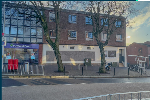
Unicorn House, Unicorn Hill, Redditch, B97