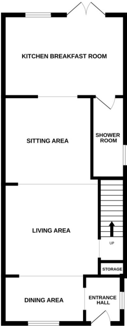
GROUND FLOOR 613 sq.ft. (56.9 sq.m.) approx.