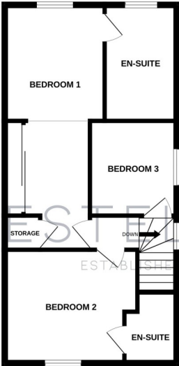
1ST FLOOR 508 sq.ft. (47.2 sq.m.) approx.