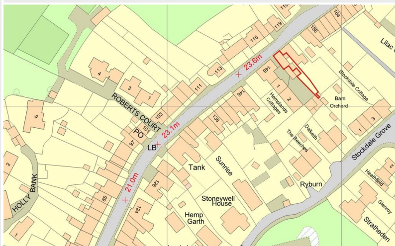
Ordnance Survey 01212737