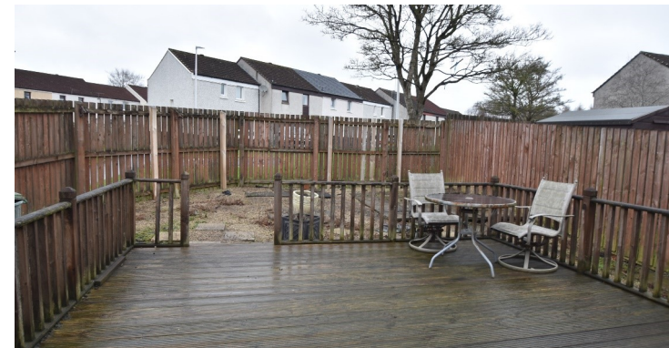
153 Sutherland Way