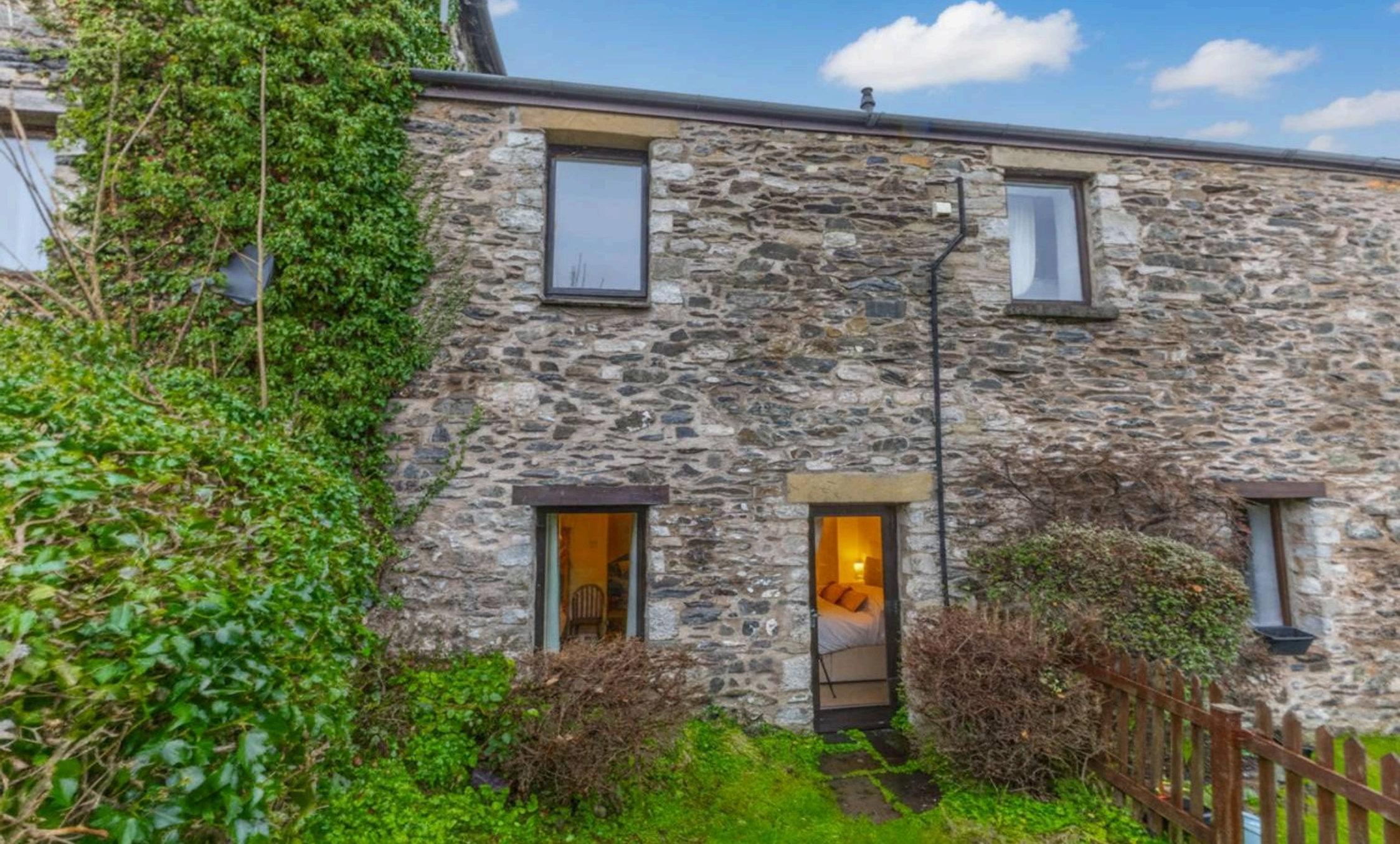
7a Stonebeck, Lindale £180,000