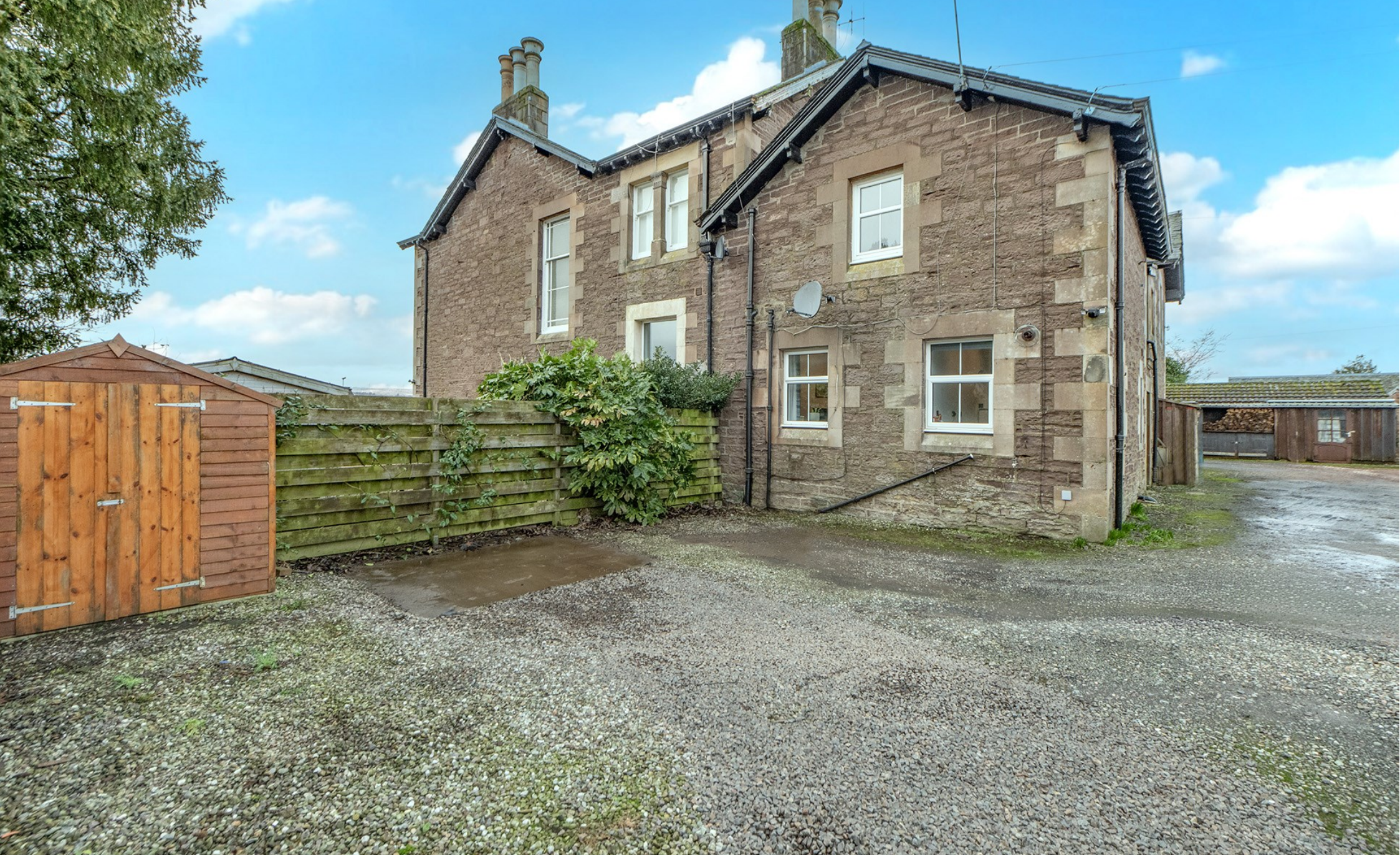
FLAT B, GOWRIE HOUSE, BROICH TERRACE, CRIEFF, PH7 3BD