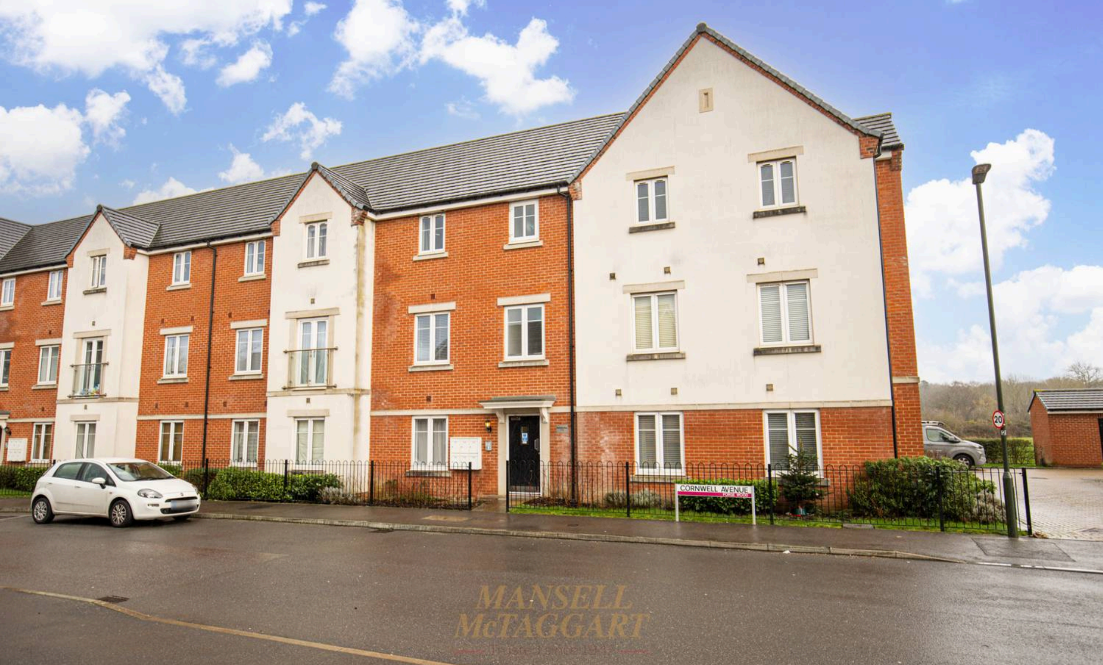
Martindale House, Cornwell Avenue, Forge Wood £280,000