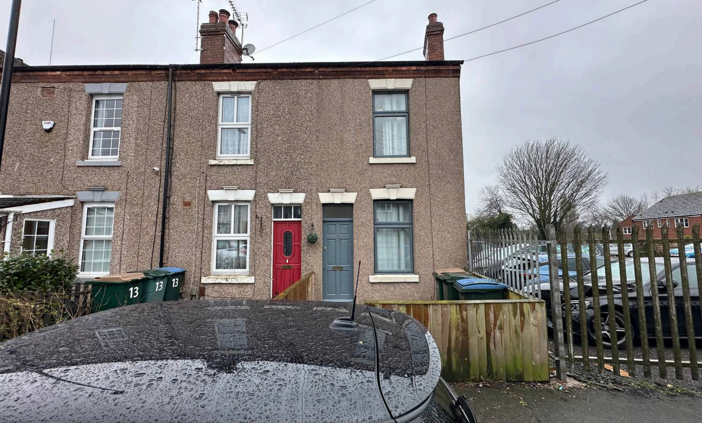
15 Spring Road, Coventry £980 pcm