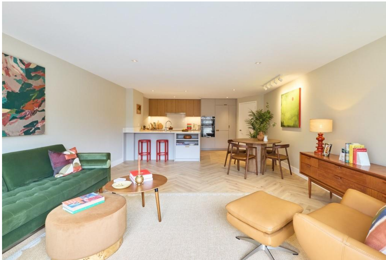
Hills Road, Cambridge