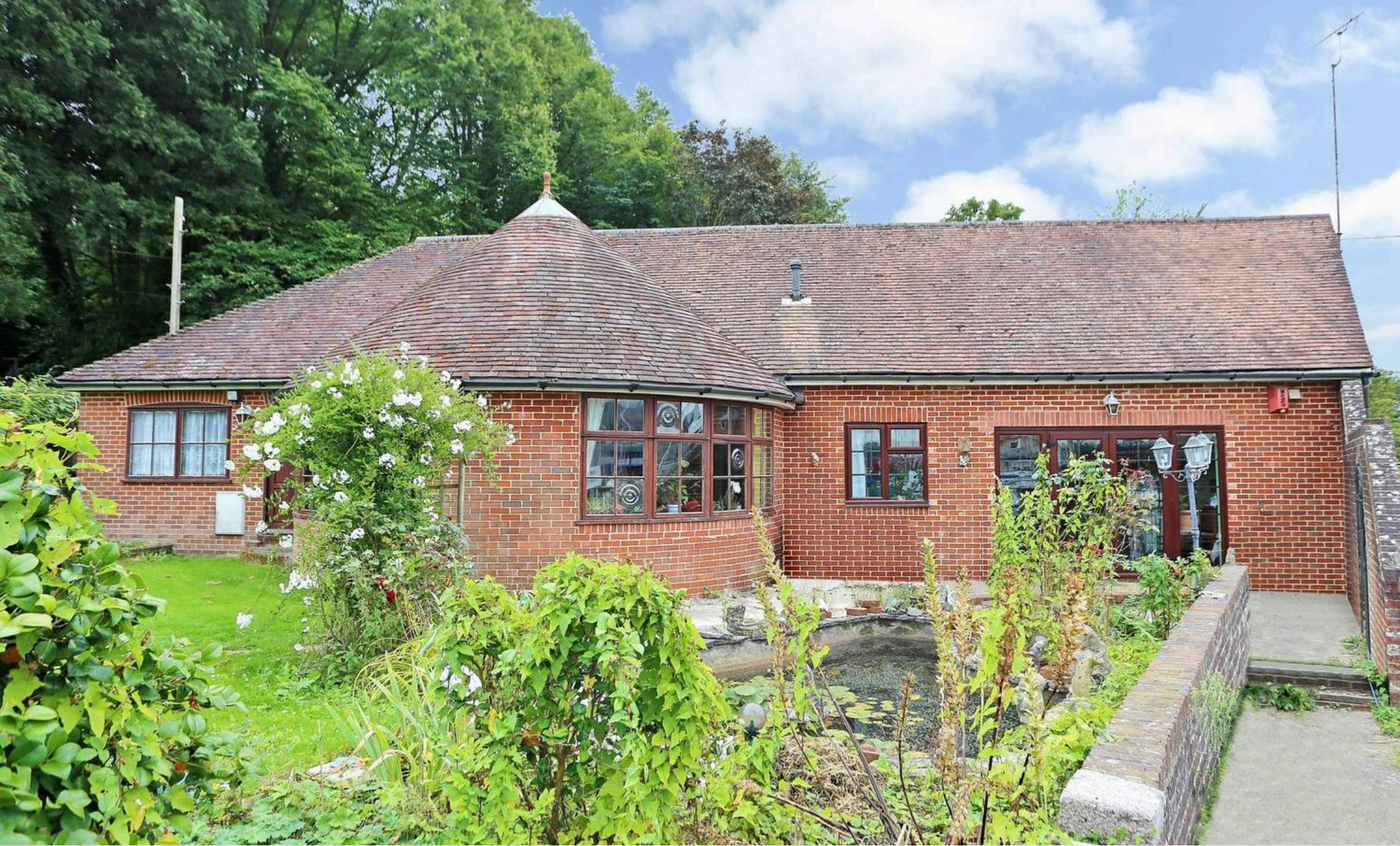
Grove Lodge, Eling Hill, Totton, Southampton, SO40 9HF £465,000