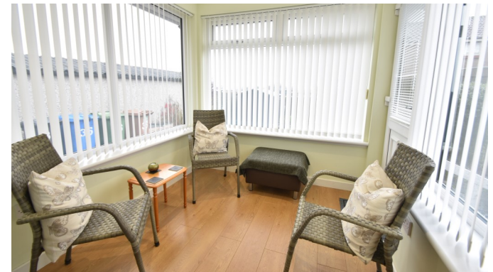
36 Galabraes Crescent