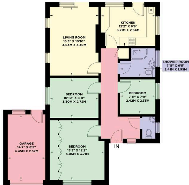
Ground Floor 85.3 sq m / 918 sq ft