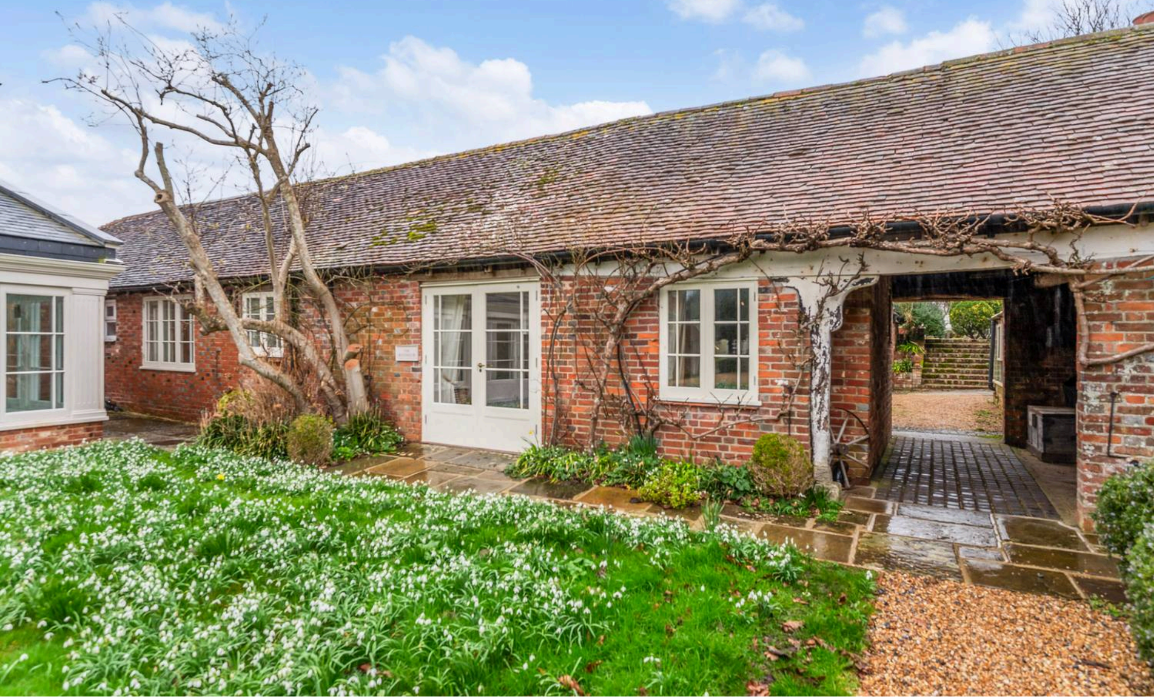
The Stables, Old Park Old Park Lane £1,500 pcm