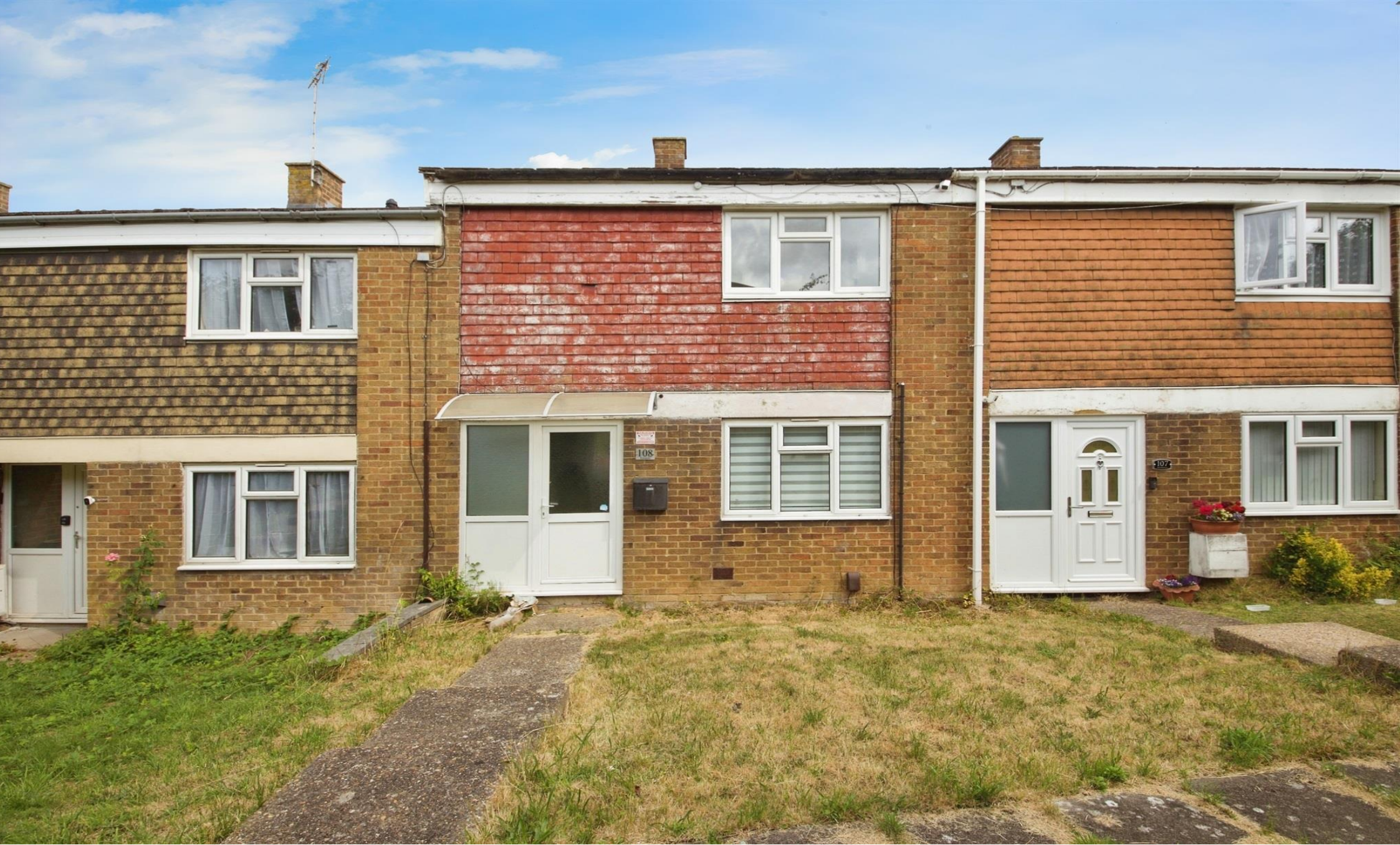
Rundells, Harlow CM18 7HD