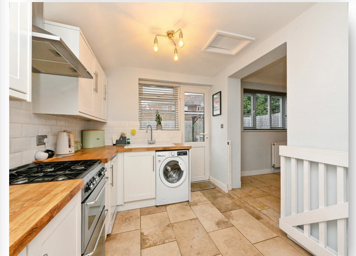
Iveagh Close, Dersingham, PE31 6YH