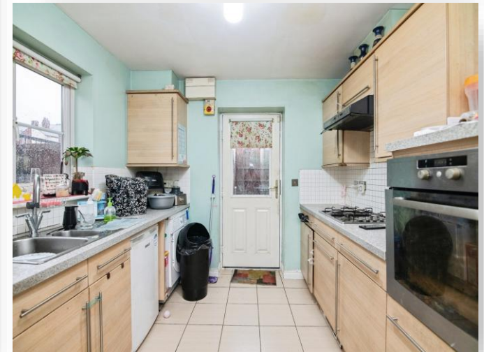
Barrett Street, Smethwick B66 4SE