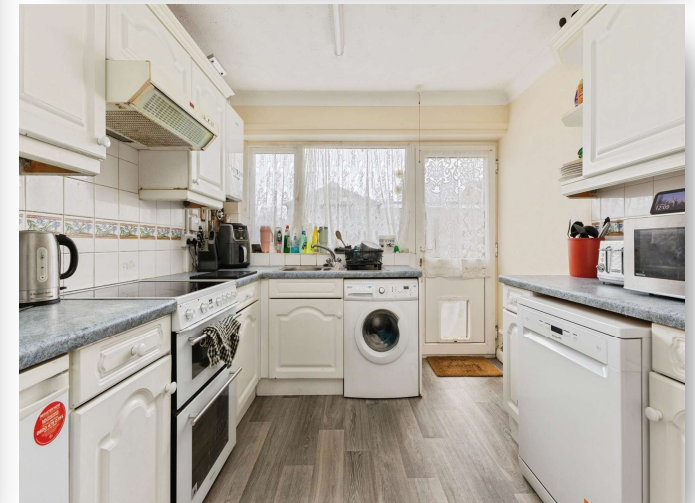
Larch Close, Attleborough NR17 2HB