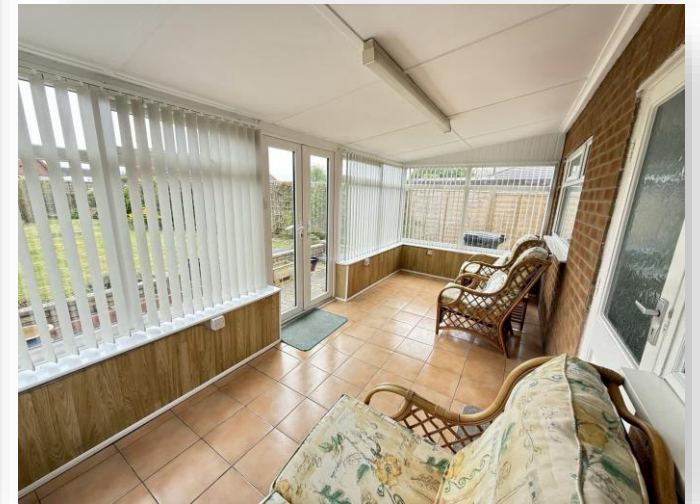
Revesby Drive, Skegness PE25 2HT