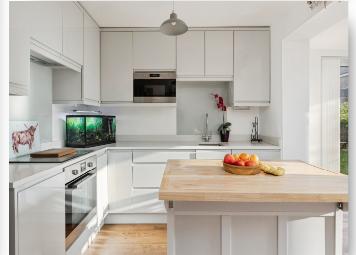
Bannister Close, ATTLEBOROUGH NR17 1YP