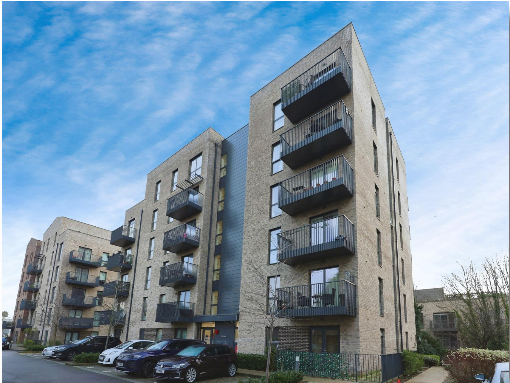
Oak Lodge, Riverwell Close, Watford, WD18 0GZ