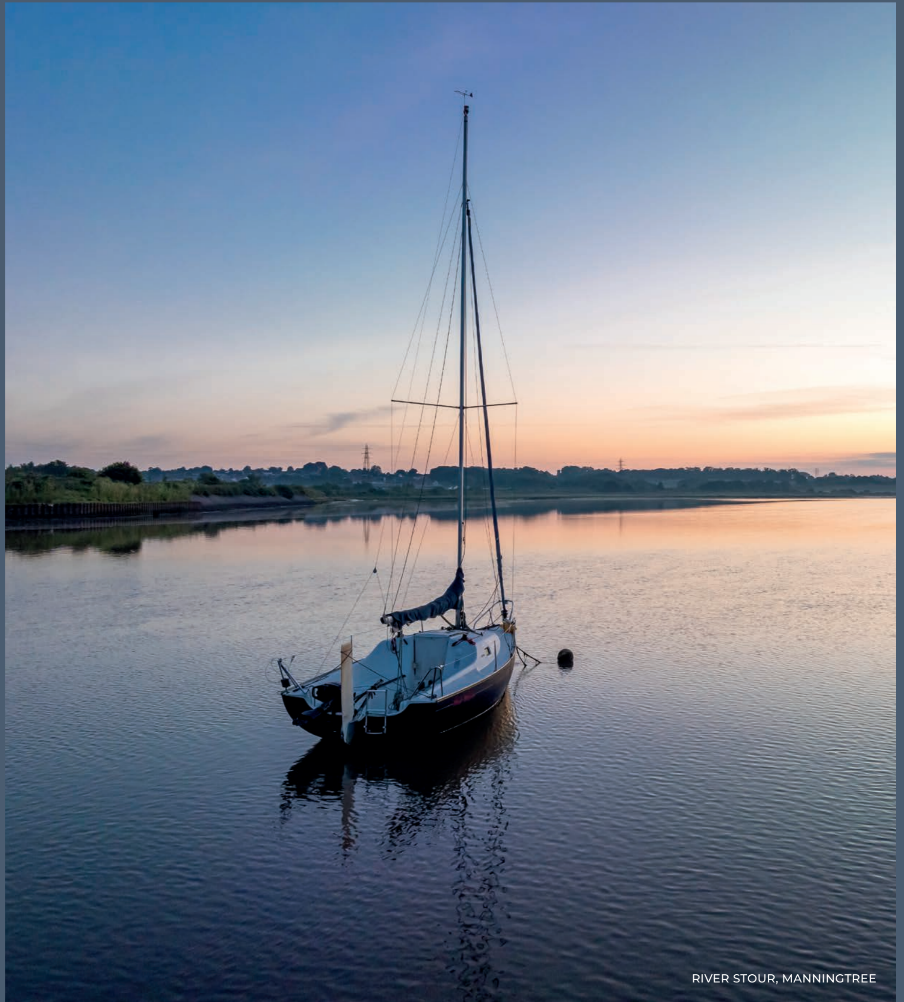
RIVER STOUR, MANNINGTREE

The Essex coastline with its glorious beaches and abundance of adrenaline-fuelled watersport opportunities is also just 14 miles* away.