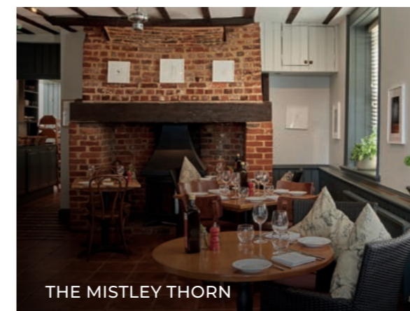
THE MISTLEY THORN