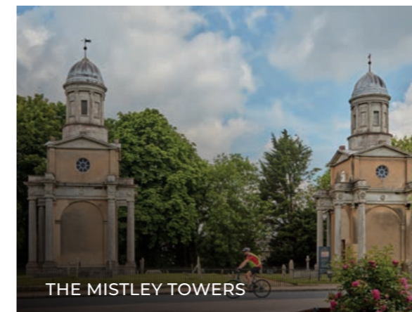
THE MISTLEY TOWERS