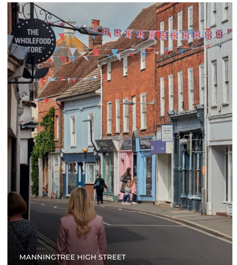
MANNINGTREE HIGH STREET