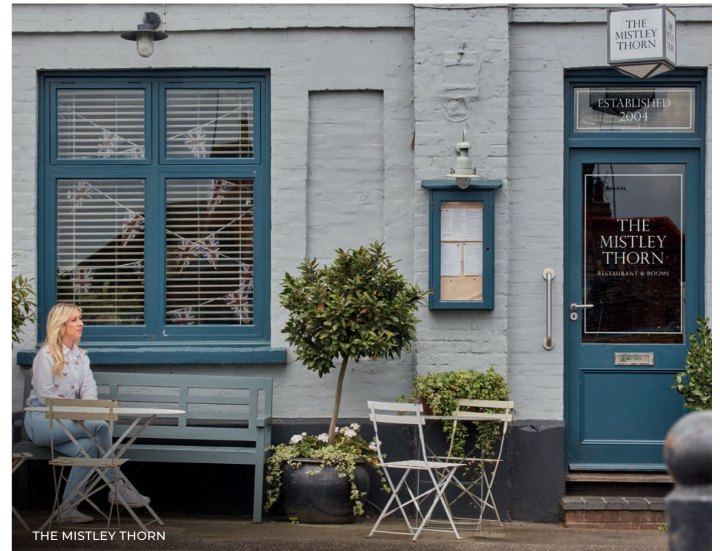
THE MISTLEY THORN

Furthermore, you can enjoy festivals, poetry evenings, drama, comedy, live music all available through the wealth of venues, clubs and societies in town.