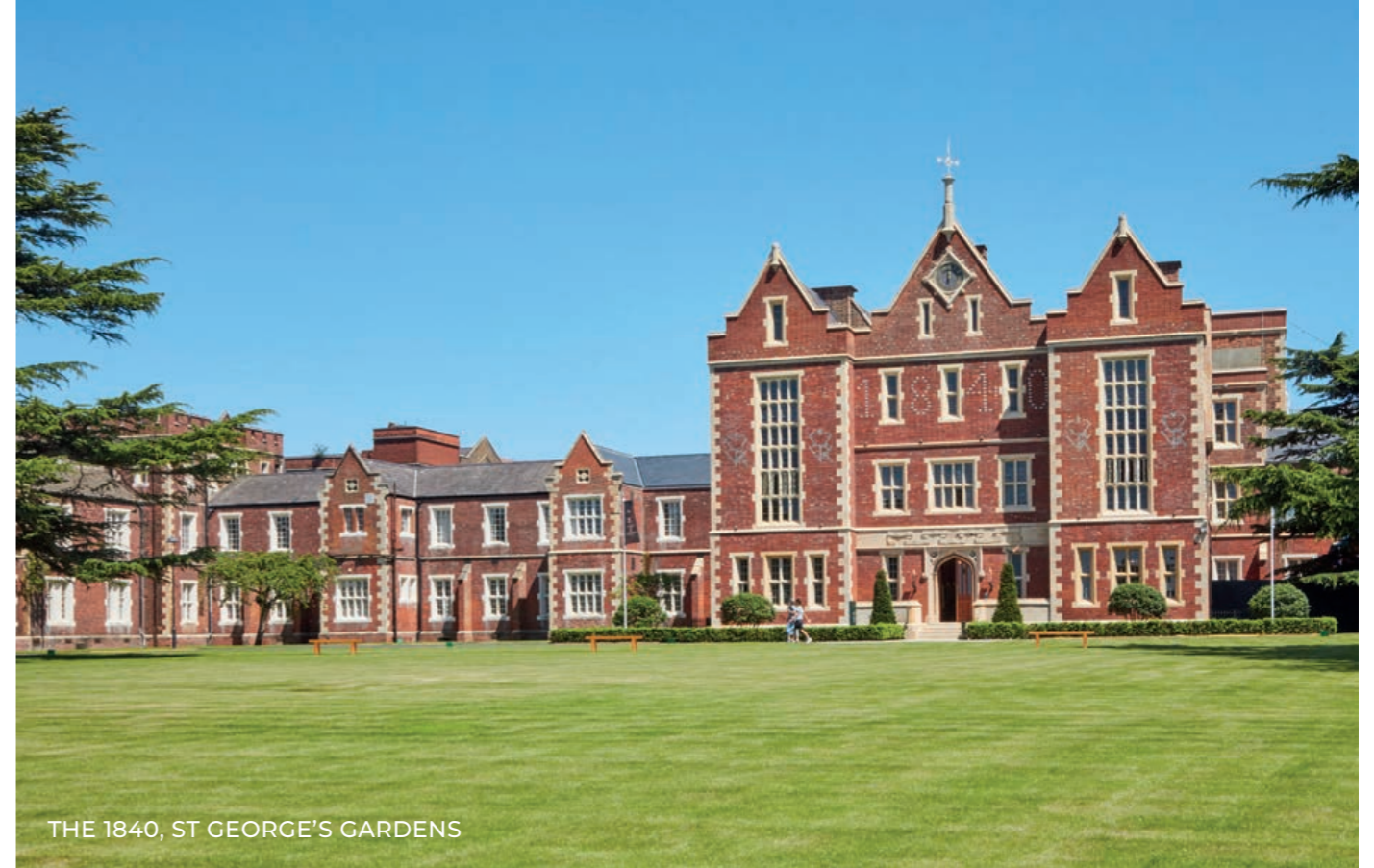
THE 1840, ST GEORGE'S GARDENS