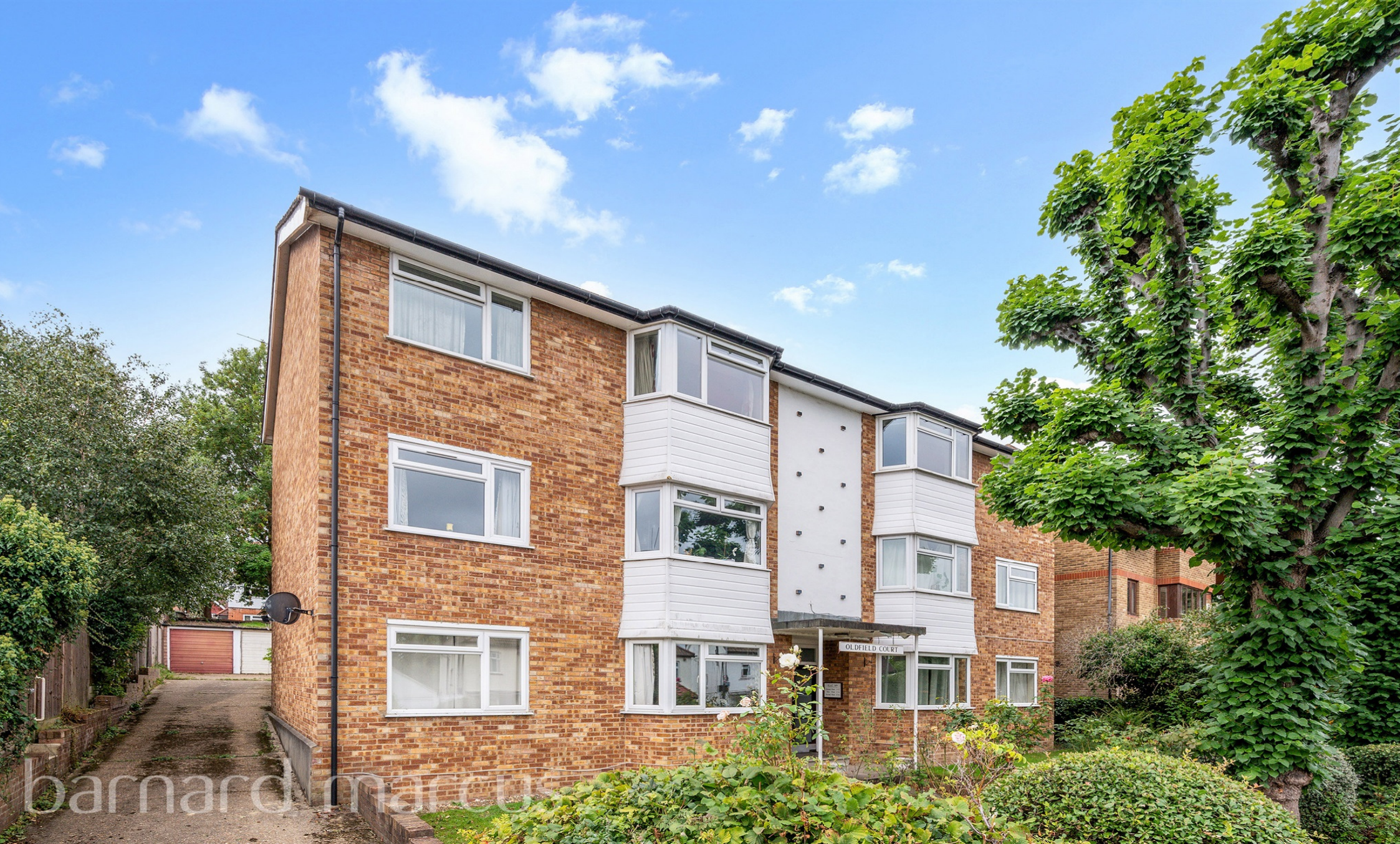
Oldfield Court, Cranes Park Crescent, Surbiton, KT5 8AW