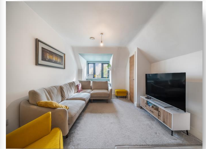
Flat 46 Lansdowne Place, Institute Road, Taplow, Maidenhead SL6 0FD