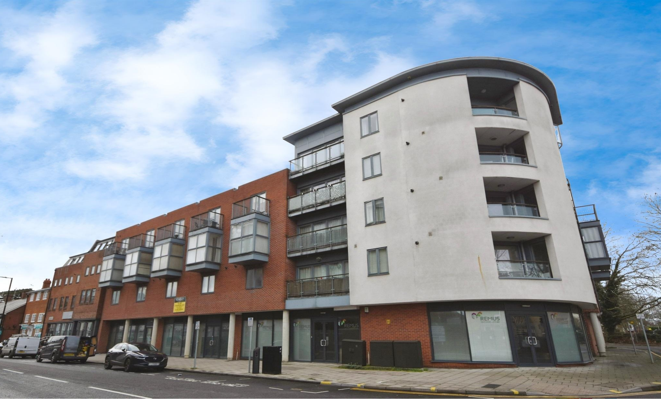
Thompson Court, Broomfield Road, CHELMSFORD CM1 1SJ