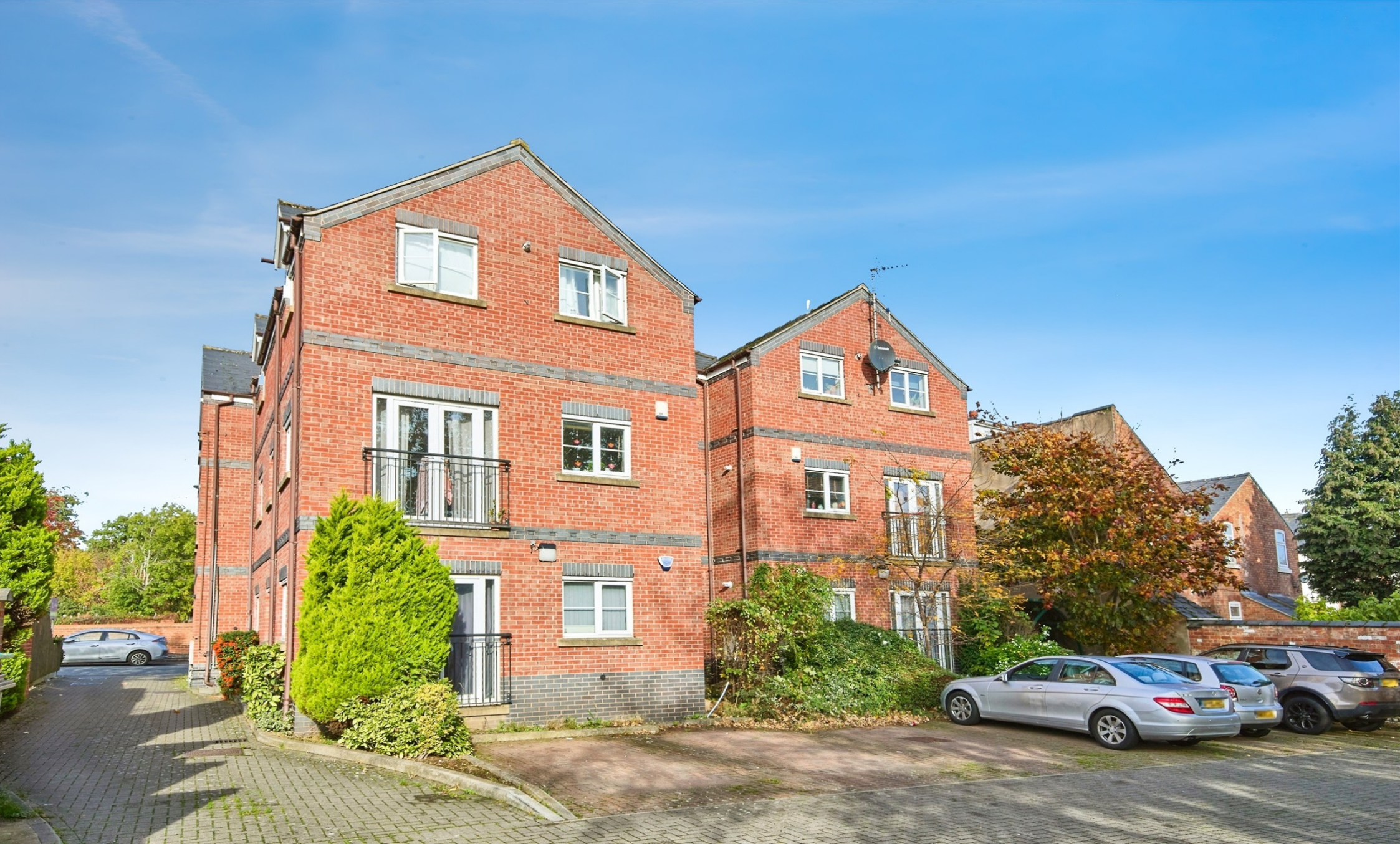
Grange Court Grange Street, Derby DE23 8BH