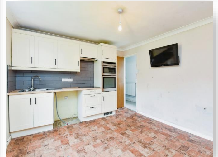
Heathway, Corsley Warminster BA12 7PJ