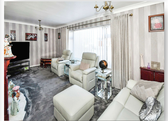
Revesby Drive, Skegness PE25 2HT