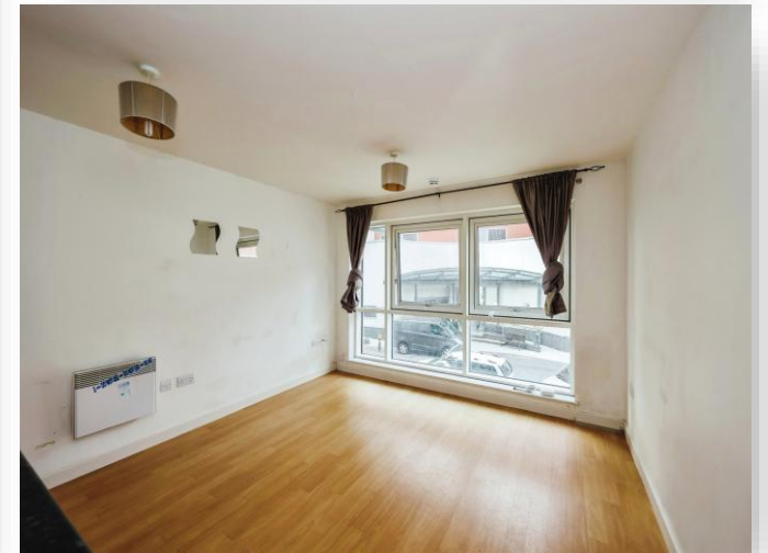
The Round House Gunwharf Quays, Portsmouth PO1 3SG