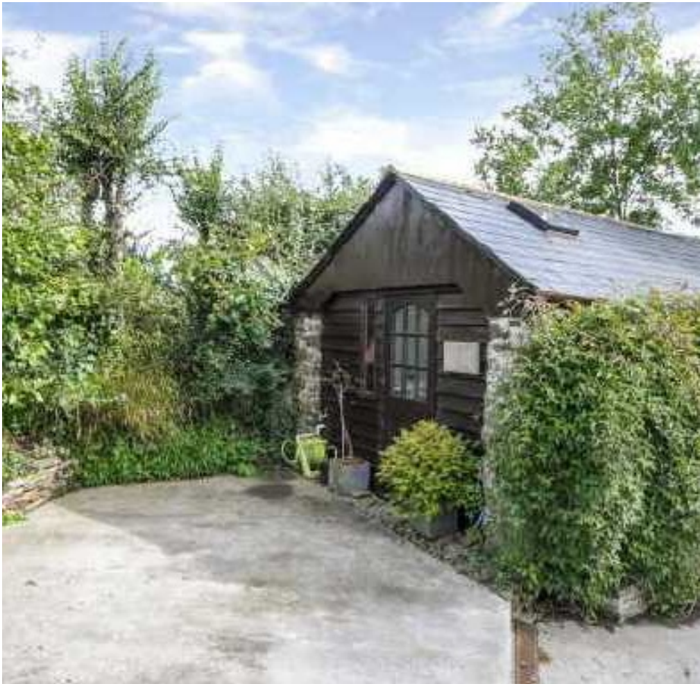
These particulars are a guide only and should not be relied upon for any purpose.

Approx. Cross Internal Floor Area 257 Sq Metres 2767 Sq Ft (Includes Garage & Annexe & Excludes Restricted Head Height)