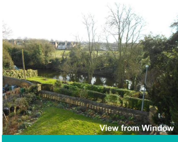
View from Window

Situated within a converted private residence along the West End. A one bedroom top floor apartment with accommodation including entrance, lounge, kitchen/breakfast room, study/store, bedroom and bathroom. Having parking within the grounds and use of riverside garden. Electric heating and double glazing. Deposit & rent payable in advance.