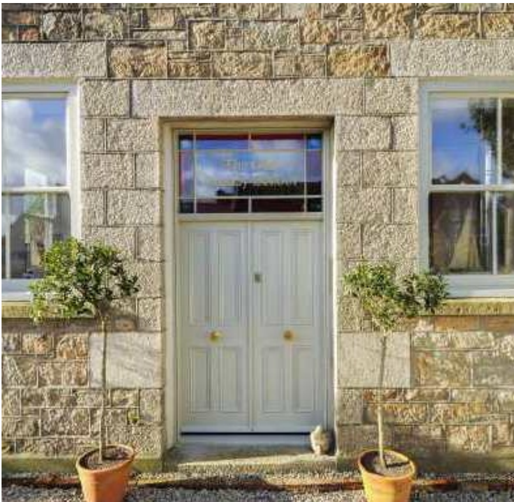
These particulars are a guide only and should not be relied upon for any purpose.

Approx. Gross Internal Floor Area 178.8 Sq Metres 1925 Sq Ft (Excludes Restricted Head Height, Galleried Area & Includes Garage)