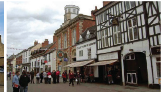
High Street Melton Mowbray