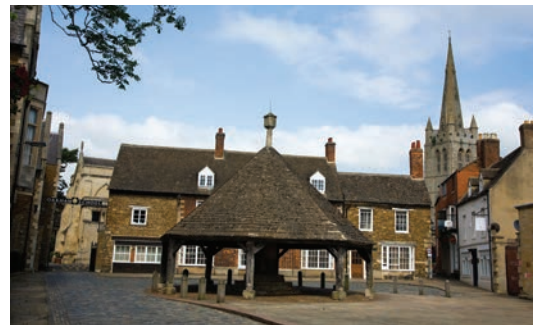
Market Place Oakham