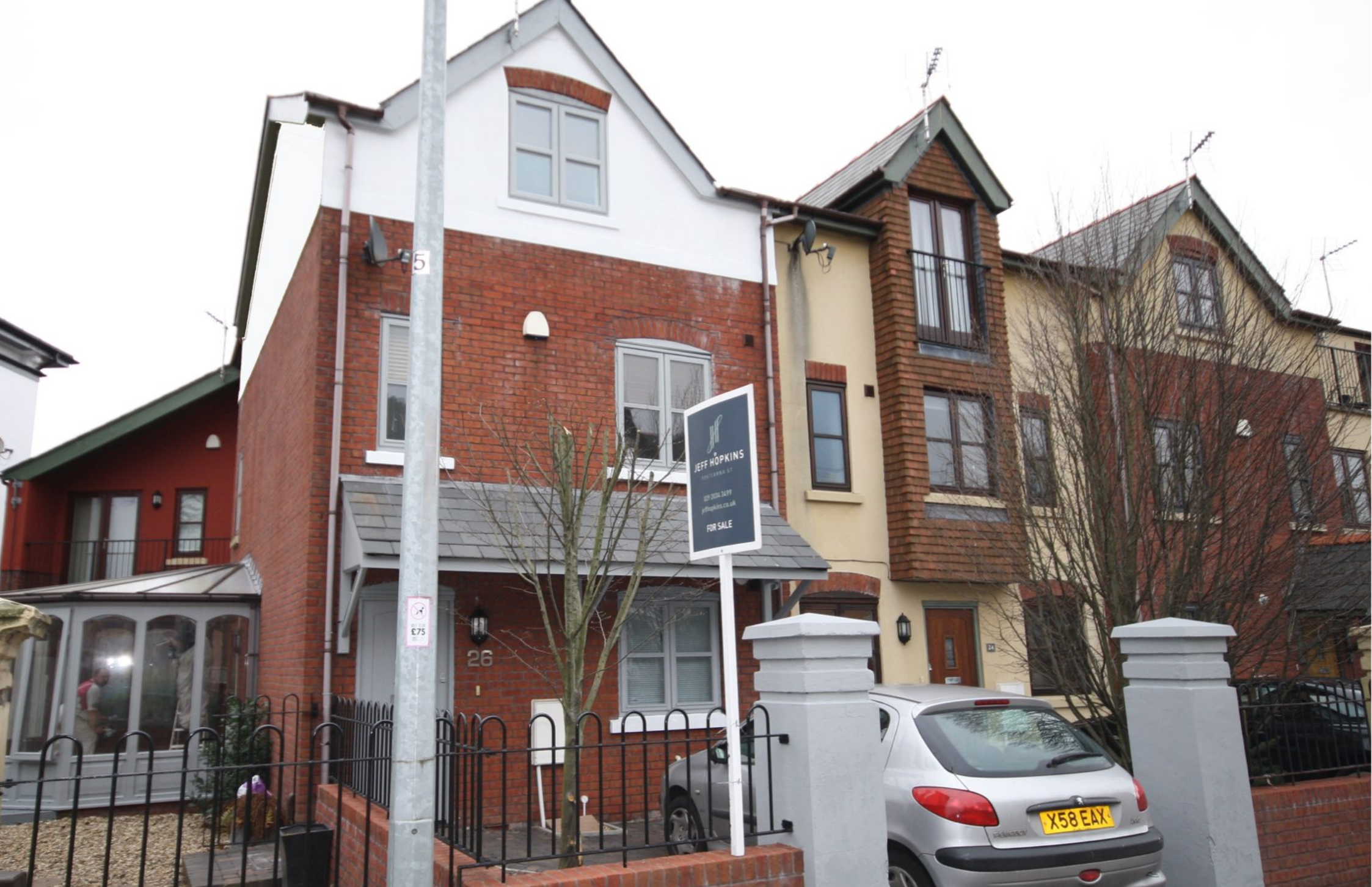
ROMILLY CRESCENT, PONTCANNA