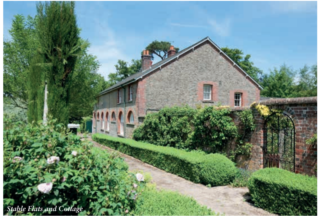
Stable Flats and Cottage