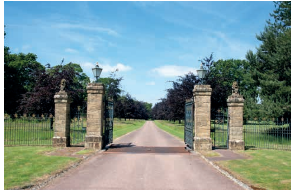
The park borders the charming and picturesque village of Warninglid