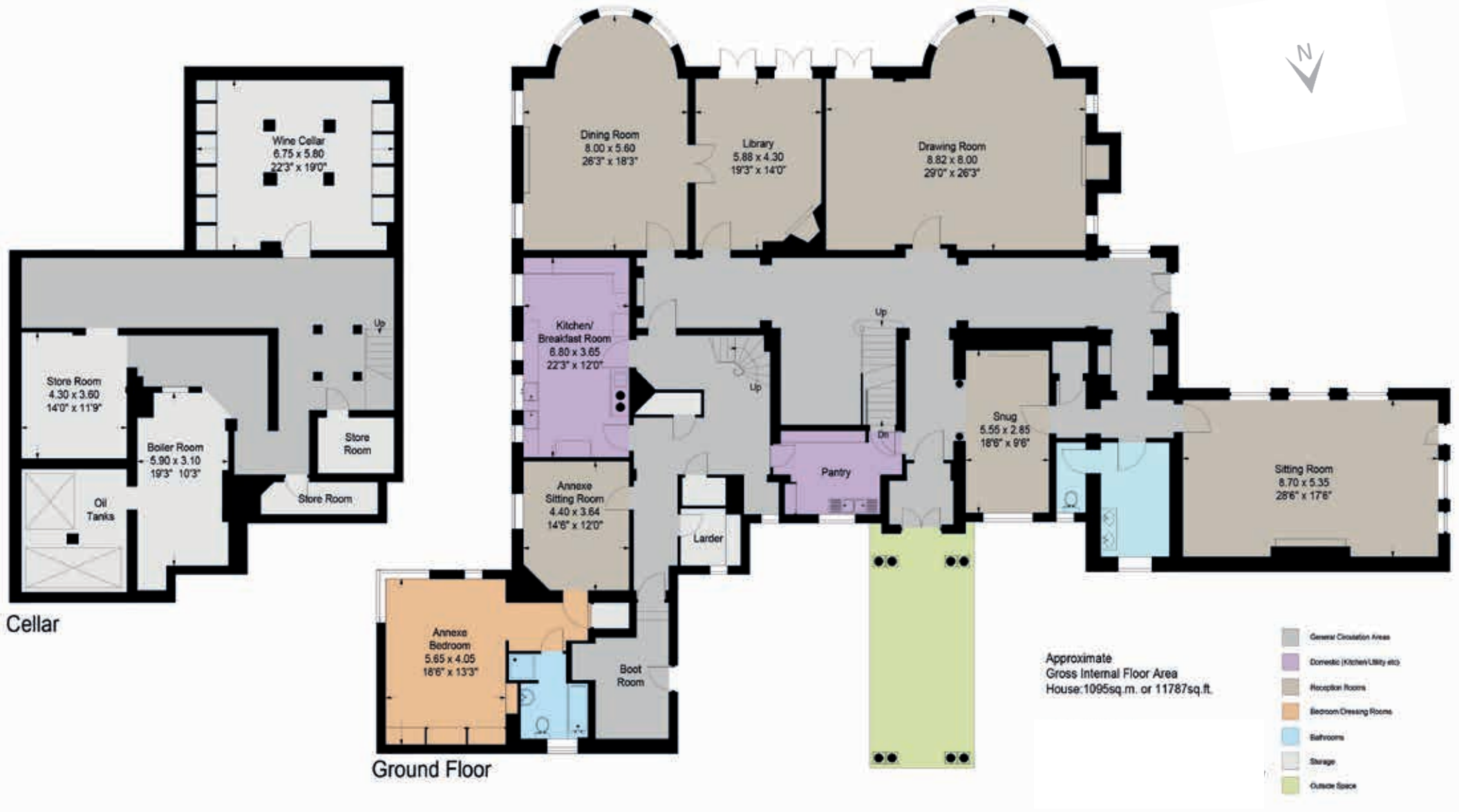
Illustration for identification purposes only. Not to scale.

No assumptions should be made as to the construction type or material of any detail on the plans.