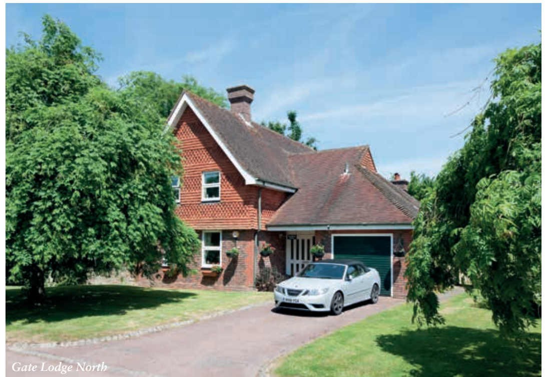
Gate Lodge North