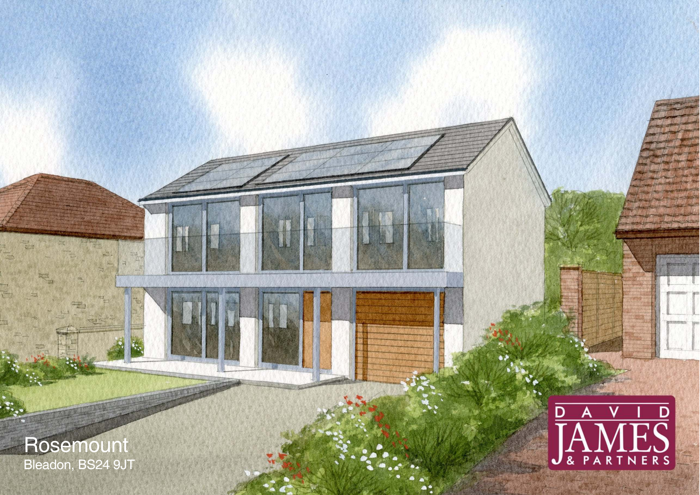
Rosemount Bleadon, BS24 9JT