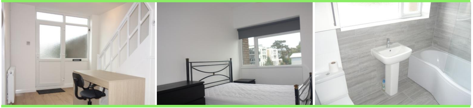
First Floor Approx. 34.8 sq. metres