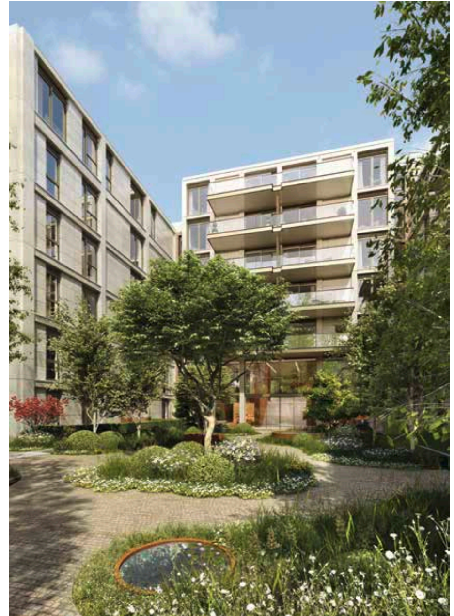
Image Computer generated image of the landscaped central courtyard garden.