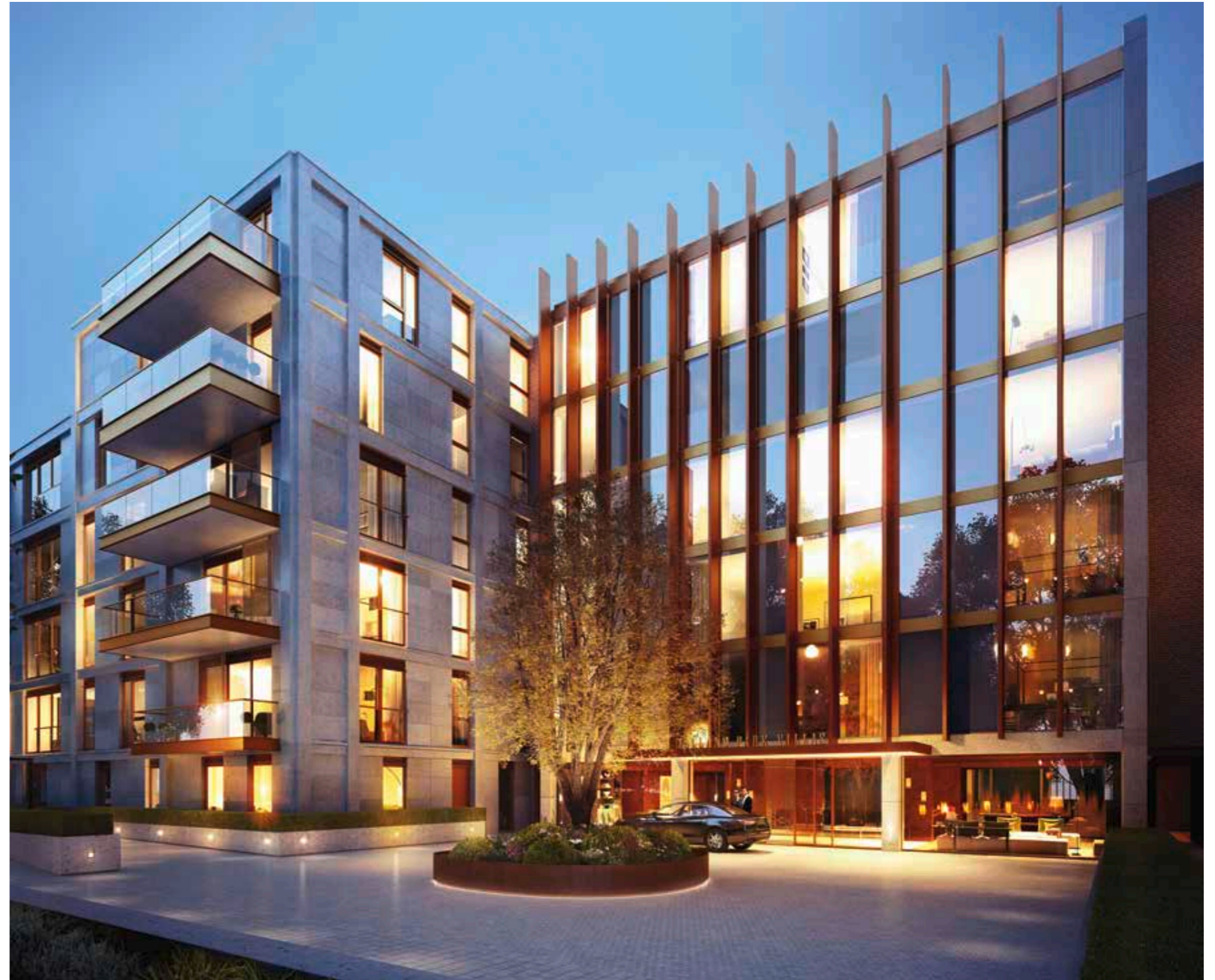
Image Computer generated image of the entrance and arrival.

A private, secure and gated development of 68 elegant apartments and 4 exceptional penthouses.