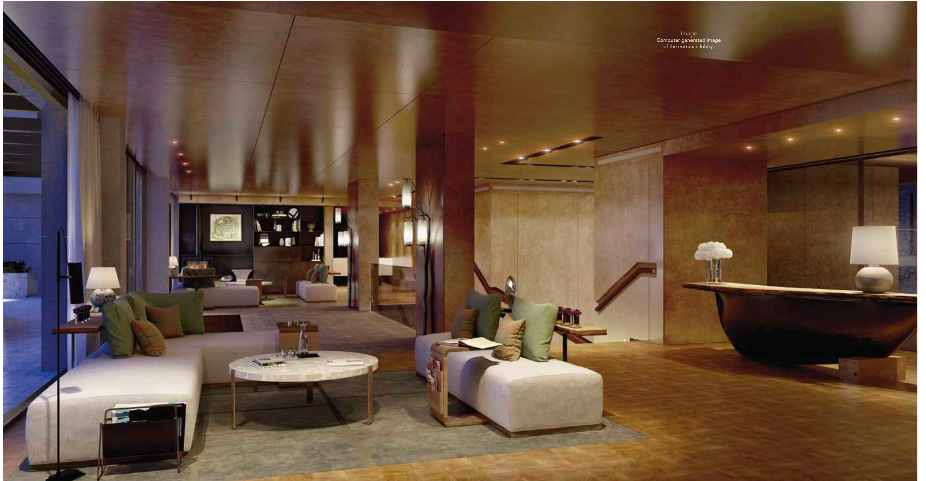
Image Computer generated image of the entrance lobby.