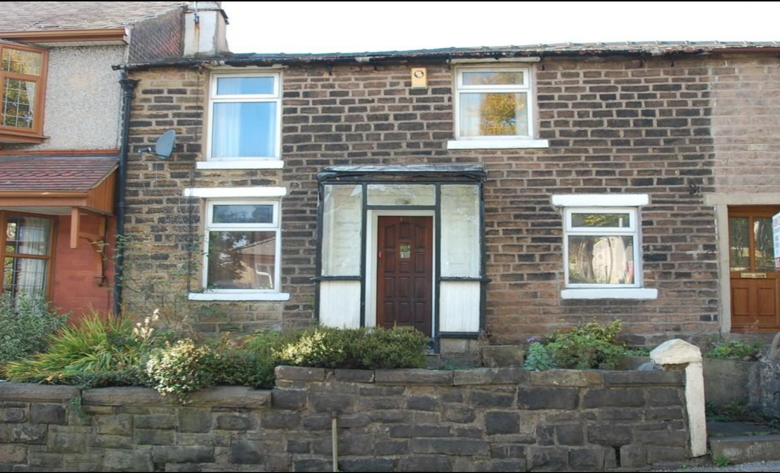
Shear Brow, Blackburn, BB1 8EA