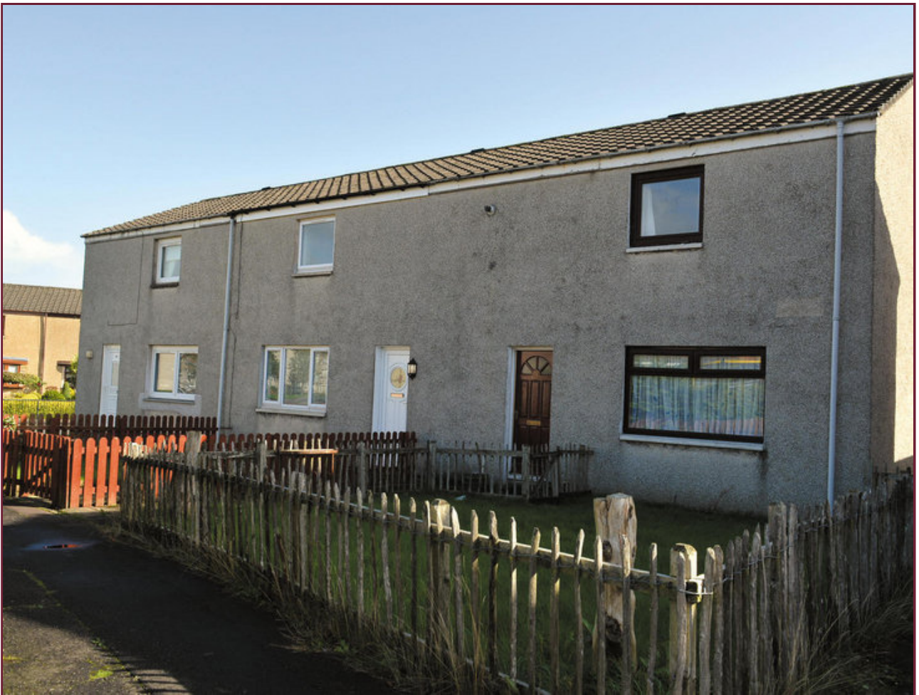
End Terraced Villa 66 North British Road Uddingston, Glasgow, G71 7AG