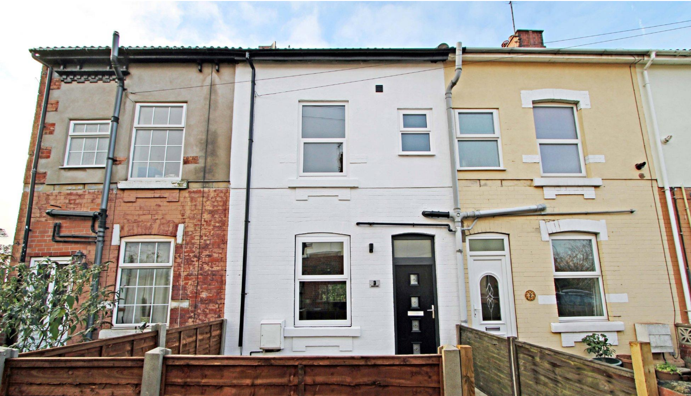
3 Church Grove, Braithwell, Rotherham, South Yorkshire, S66 7AR