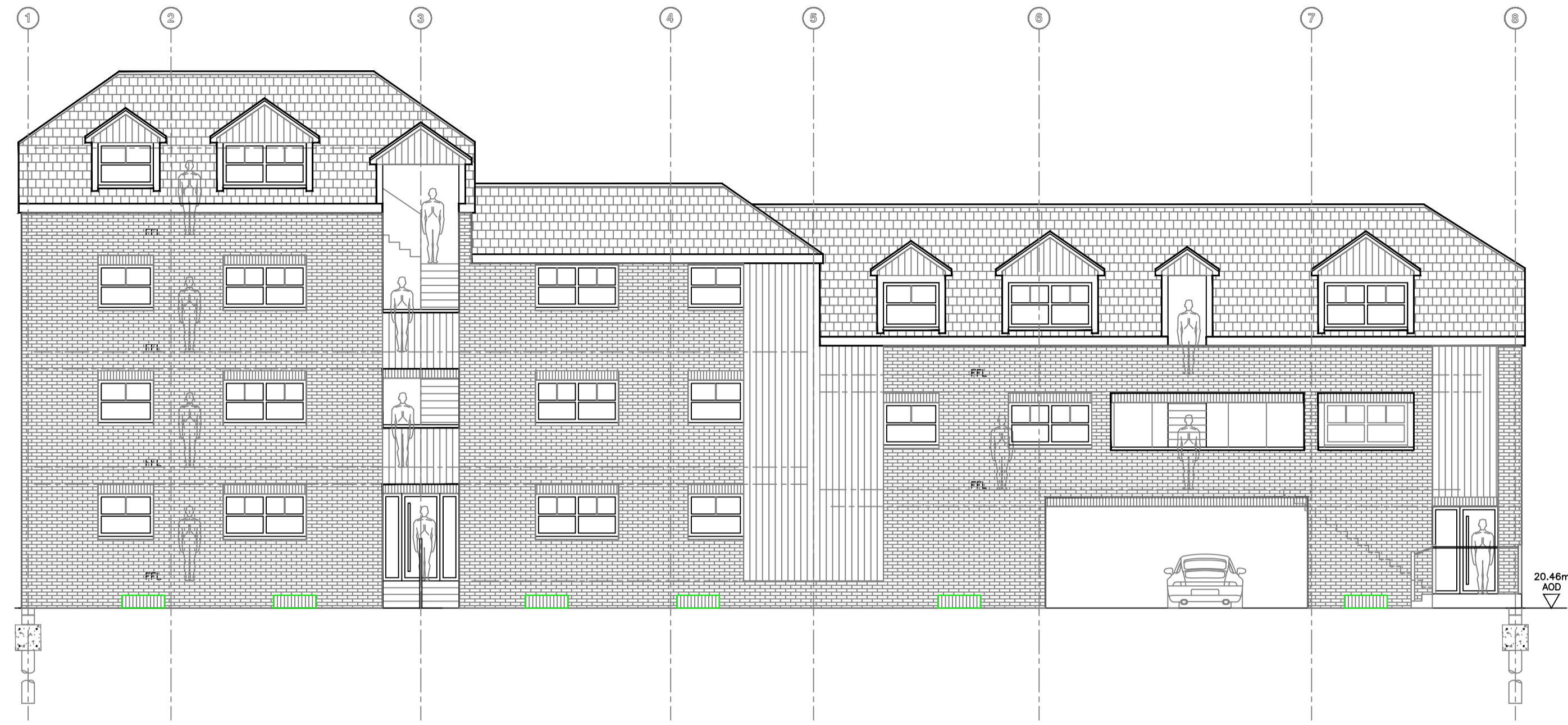
PROPOSED NORTHWEST FRONT ELEVATION