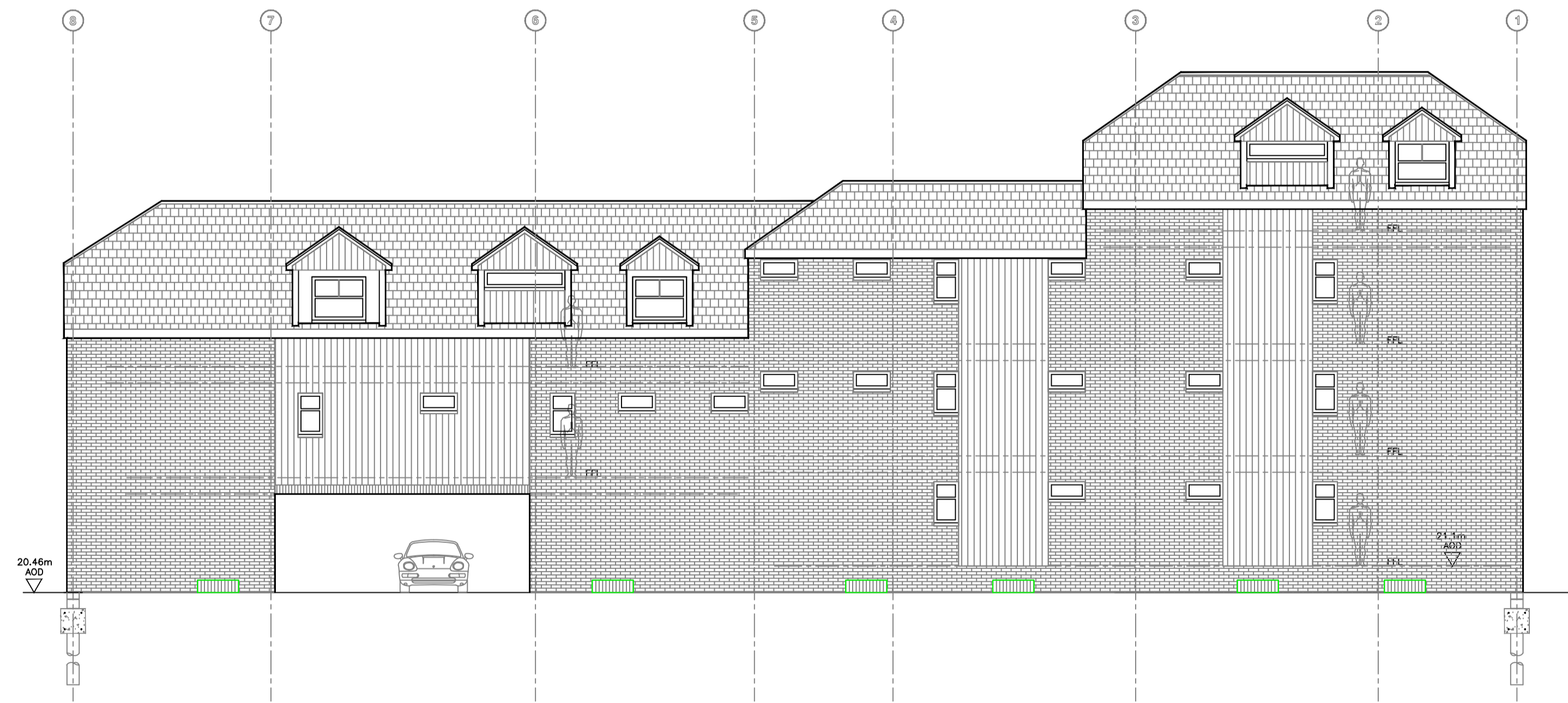
PROPOSED SOUTHEAST REAR ELEVATION