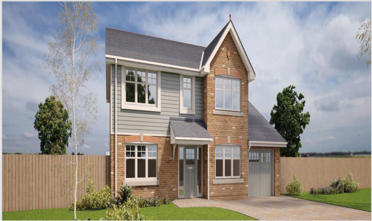
“The Oxford”, Royal Park (Phase 2), Ramsey Prices from £389,999

The latest development of homes at Royal Park, Ramsey, will be made up of 81 detached 4 and 5 bed houses situated just a minute away from Mooragh Park, promenade and beach. Each property will feature open-plan, fully-fitted dining kitchens, bi-fold doors to rear patio, garages and off-road parking.