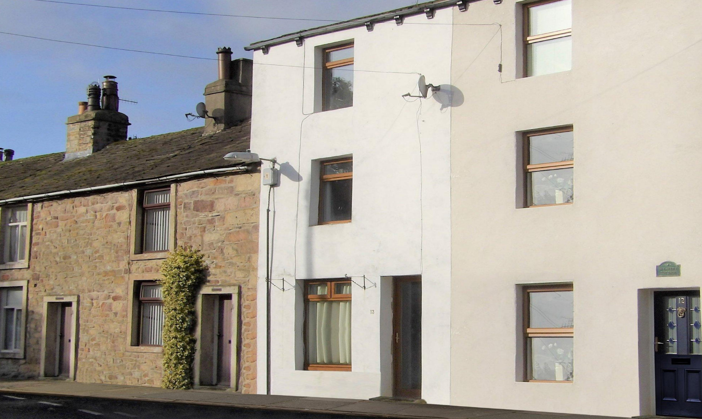
Elm Tree Square, Embsay £550 pcm + Fees Apply