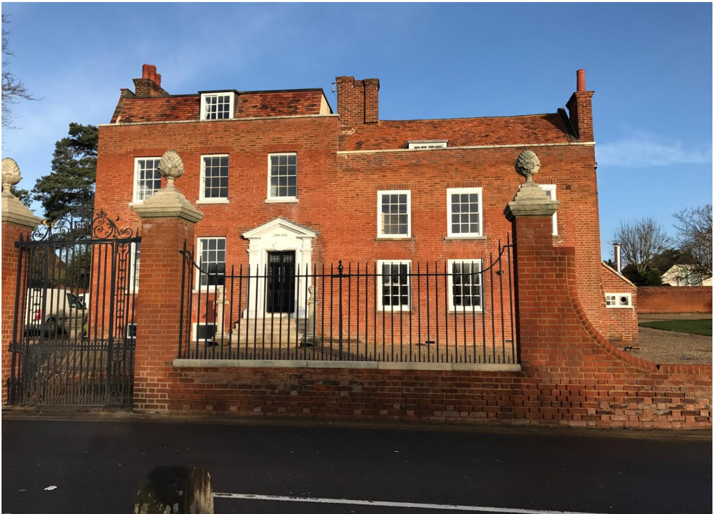
Cedar House, Mill Road, Cobham, Surrey, KT11 3AL Price on Application