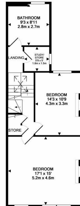
1ST FLOOR APPROX. FLOOR AREA 611 SQ.FT. (56.8 SQ.M.)