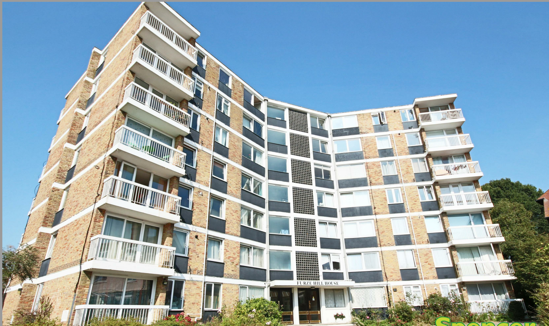
Furze Hill House, Furze Hill, , Hove BN3 1PU