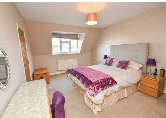
Council Tax Band