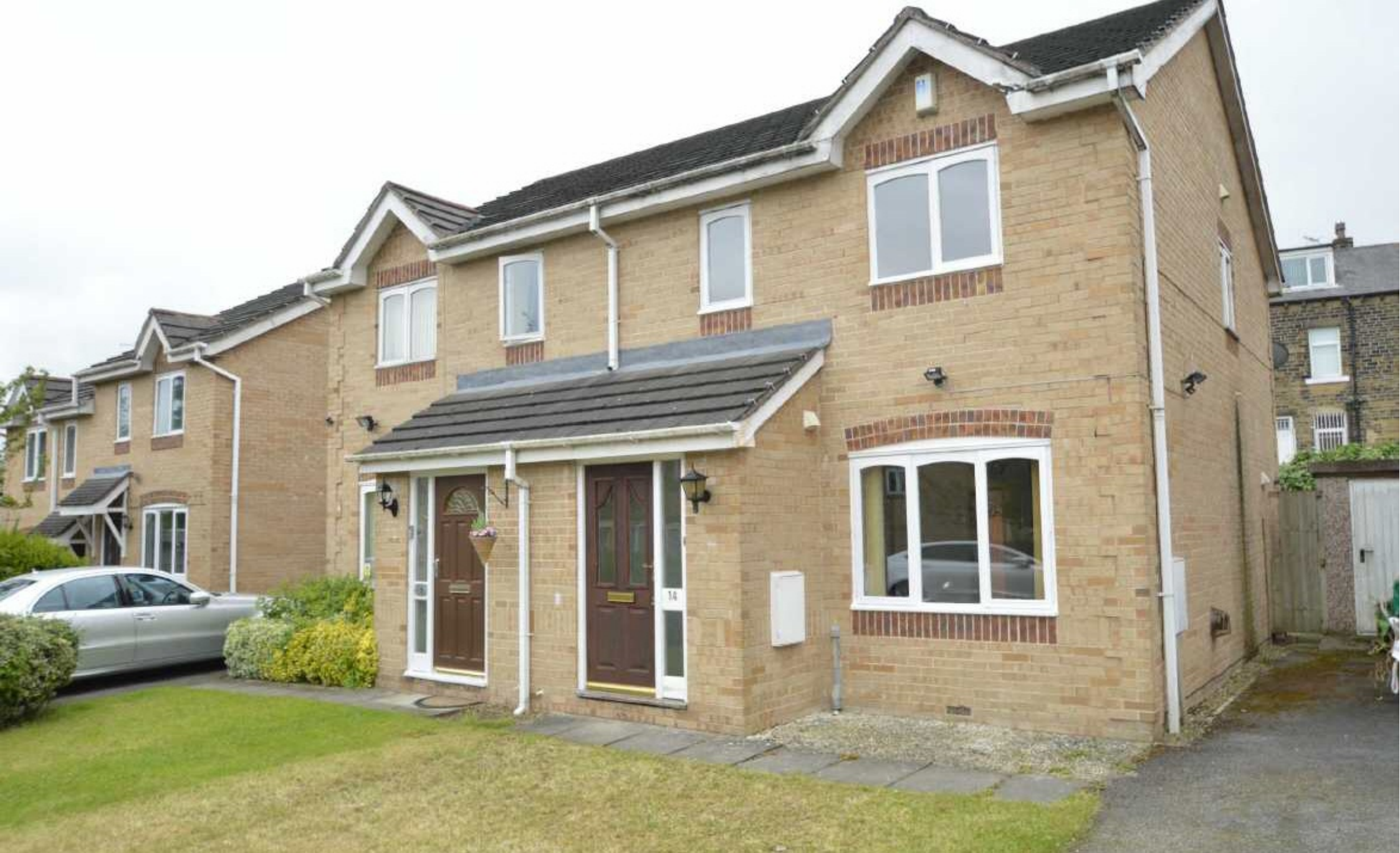
14 Carling Close, Bradford