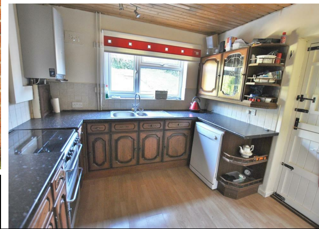
Amercombe Walk, Stockwood