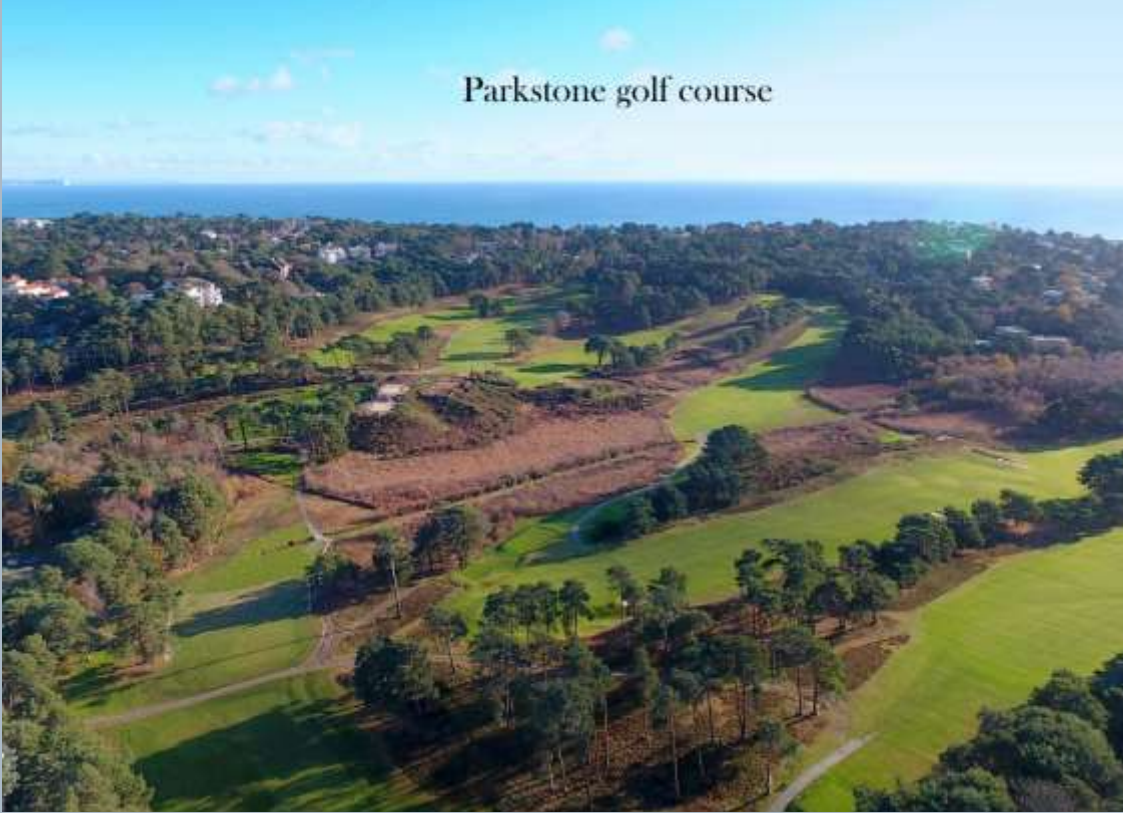
Parkstone golf course